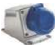
WALL MOUNTED SOCKETS